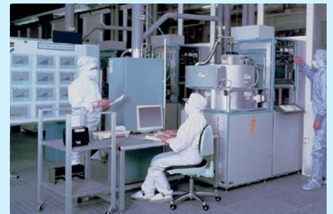
Labs and clean areas