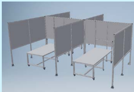
Patient isolation cubicles