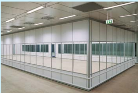
Temporary isolation rooms

Our framing systems can help support the needs of medical providers to scale up their operations. Take a look at some examples of how Bosch Rexroth can help!